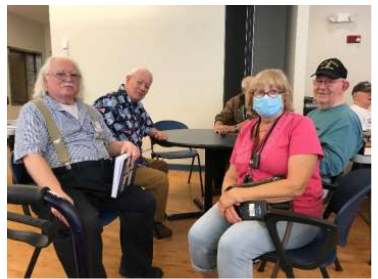
Members of USCS, Nathen Hale Chapter share a moment.